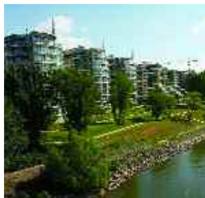
> MARINA PROJECT: close to the city center but you still get the atmosphere of being outside the city - quiet, peaceful and good quality place in a gated community.

Autoker Holding is owned by two private citizens from Israel. The company's main activity is real estate but the holding also has a sub-division dealing with logistics. "We have thousands of square meters of warehouses that are rented